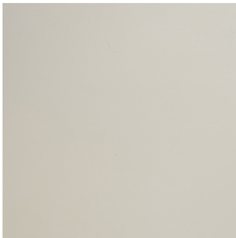
MATT WHITE LACQUER