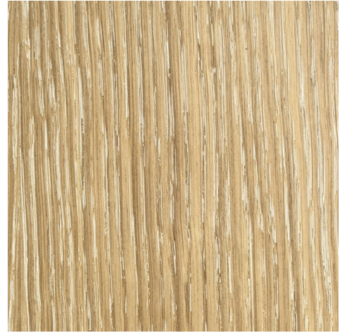
CERUSED NATURAL OAK