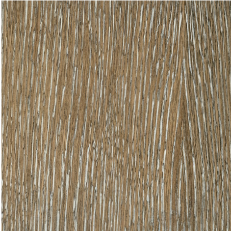
CERUSED BROWN OAK