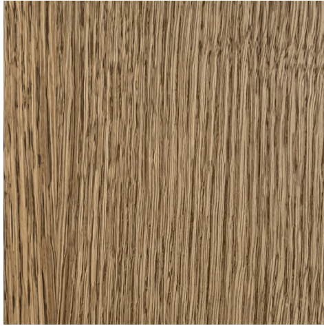
BRUSHED BROWN OAK