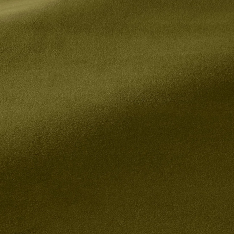
TOUNDRRA VELVET - PIERRE FREY The full range colors is available