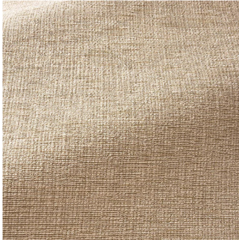
MEDICIS CHENILLE - PIERRE FREY The full range colors is available