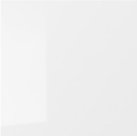
HIGH-GLOSS WHITE LACQUER