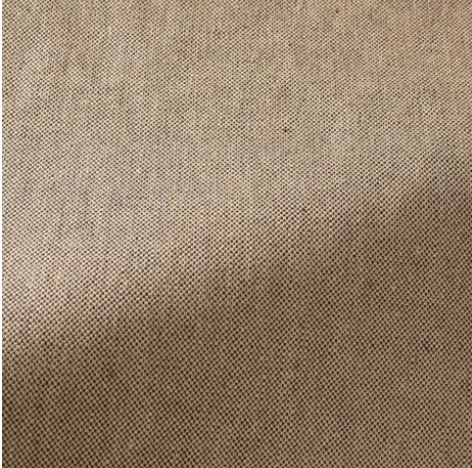
GOLF, LINEN - PIERRE FREY The full range of colors is available