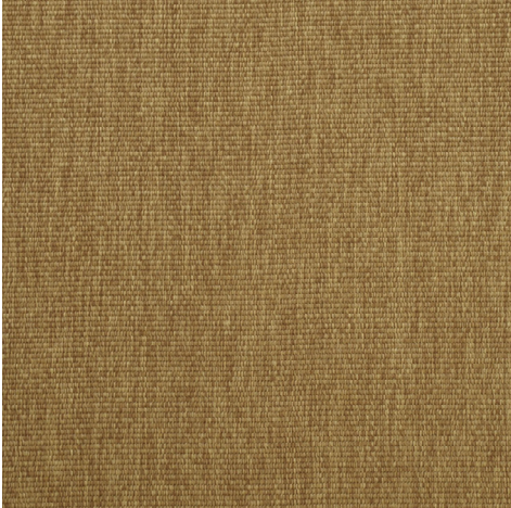
AMALFI, INDOOR/OUTDOOR - JIM THOMPSON The full range of colors is available