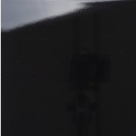
HIGH-GLOSS BLACK LACQUER